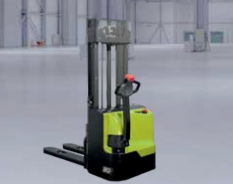
Pallet Stacker Multi-purpose Vehicle 2000 kg