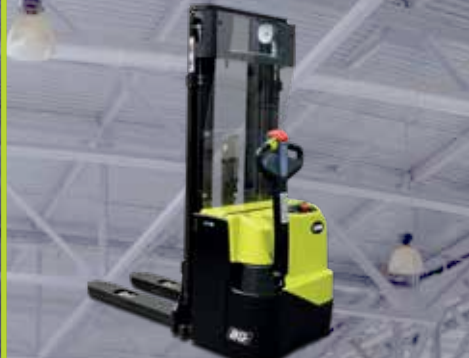
Pallet Stacker 1600 kg