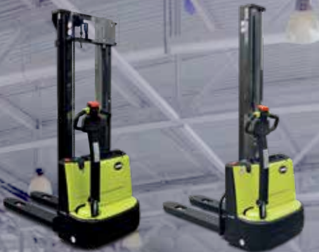
Pallet Stacker 1200 kg