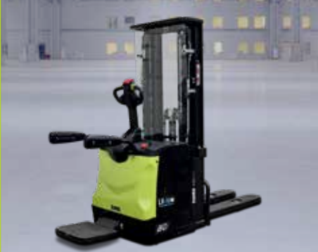
Pallet Stacker Platform version 1600 kg