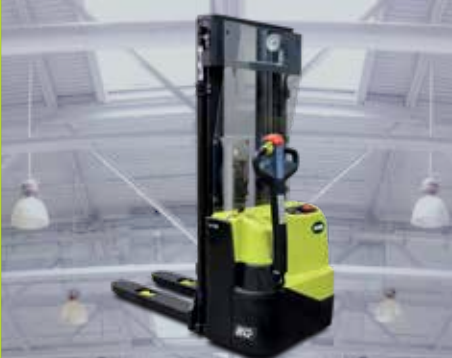
Pallet Stacker 1200 kg