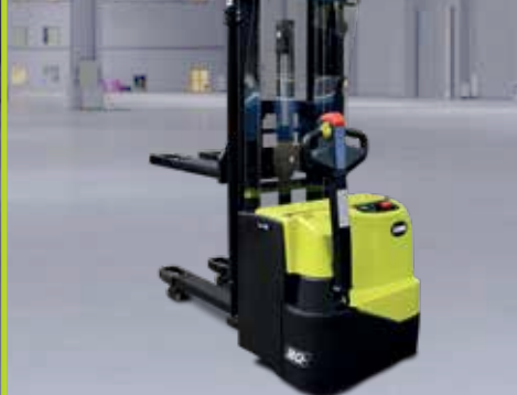
Pallet Stacker 1600 kg